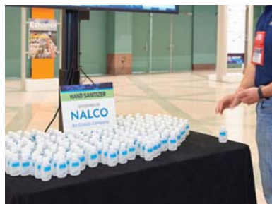
Hand Sanitizer Stations